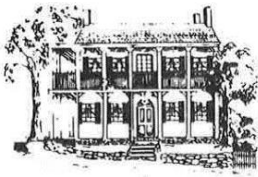
Phoenix House c. 1820